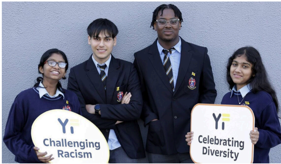
The North Mon is awarded a yellow flag in recognition of intercultural and anti-racism policies.