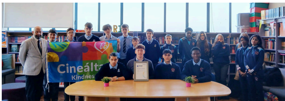
The North Mon is awarded ISPCC SHIELD Anti-Bullying Cert