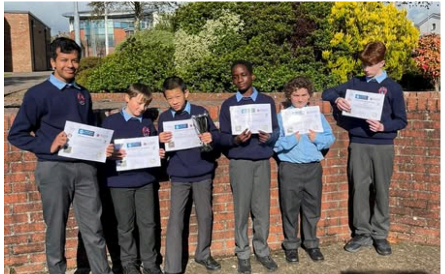
1 st and 3 rd place winners in the Math's Week Quiz in Terrence MacSwiney Community School