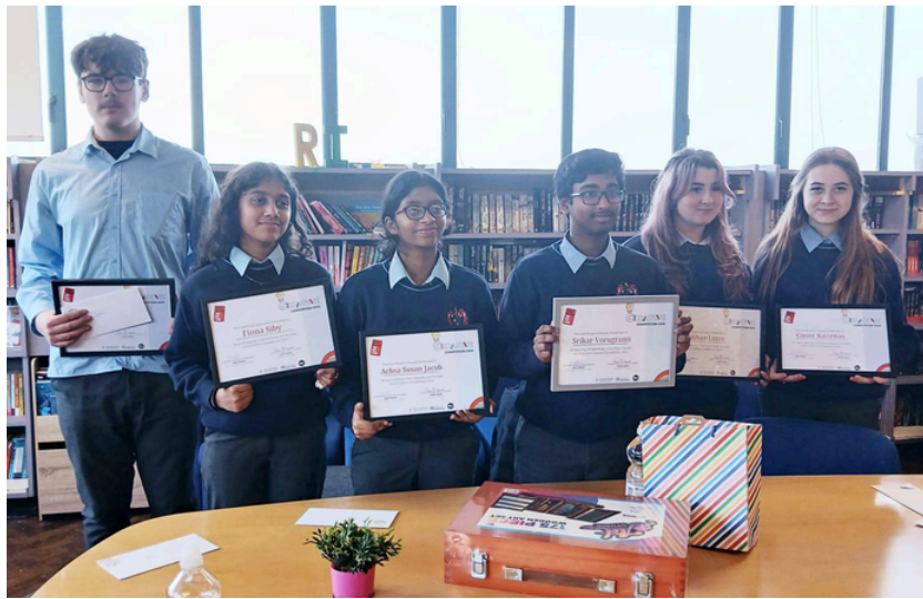
Winners of Show Racism the Red Card competition who made poems, posters and an animated film to bring awareness to the issue of racism.